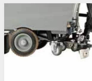
Compact format and pivoting wheels: manoeuvrability and control