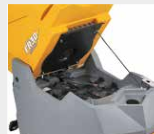
Tiltable recovery tank