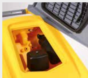
Debris tray + recovery tank filter