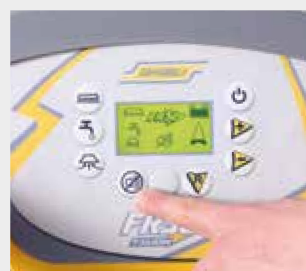
"Silent mode" function