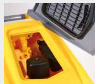
Debris tray + recovery tank filter