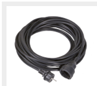
15 m cable as standard