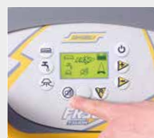
"Silent mode" function