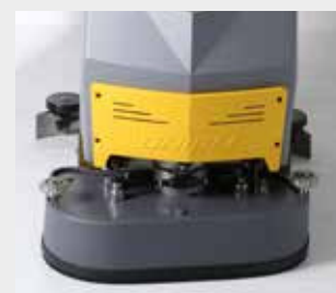
Twin brush deck