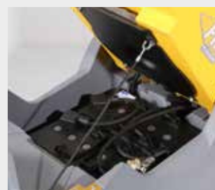
Easy access to the main components