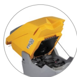
Tiltable recovery tank