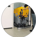
Adjustable and compact squeegee