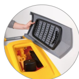
Debris tray + recovery tank filter